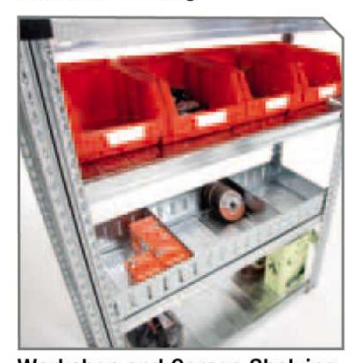
Workshop and Garage Shelving

We also offer a wide range of accessories for Supershelf™ including plastic shelves, steel storage bins, bin fronts, shelf dividers and label holders