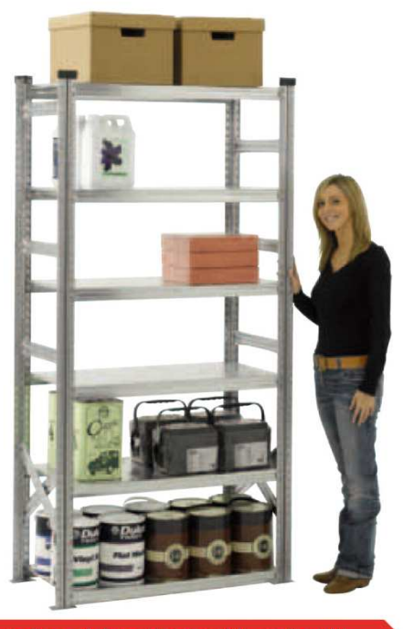
Supershelf™ is probably one of the most versatile shelving systems on the market, with its variety of interchangeable and multipurpose components it can be adapted to suit an endless variety of applications including :