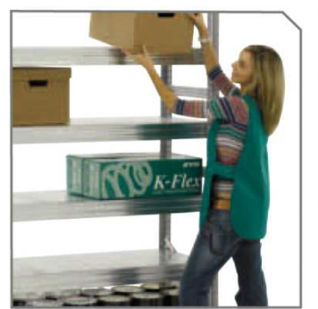
Shortspan and Longspan